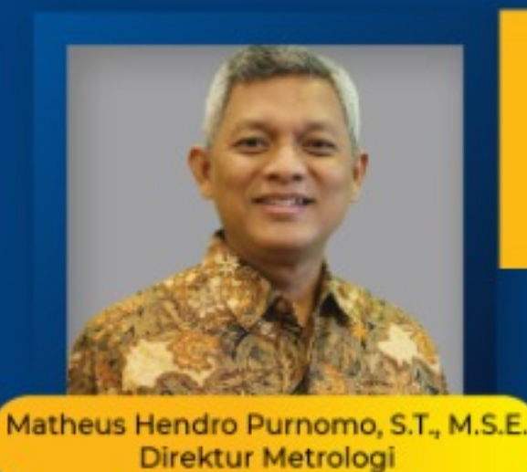
TOPIK "Tantangan Tertib Ukur di era digitalisasi"

TOPIK "Perkembangan Teknologi Digital dalam Pengujian Kuantitas dan Kualitas"